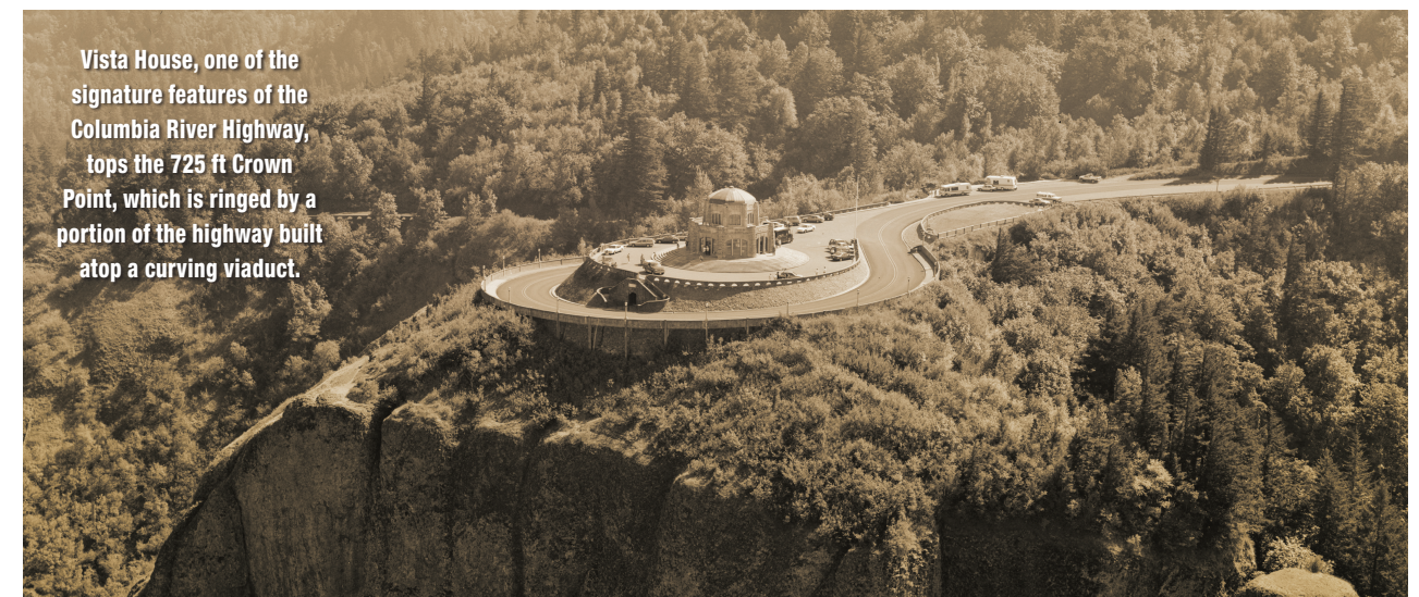
Vista House, one of the signature features of the Columbia River Highway, tops the 725 ft Crown Point, which is ringed by a portion of the highway built atop a curving viaduct.

"One of the things that ties together all of those bridges is