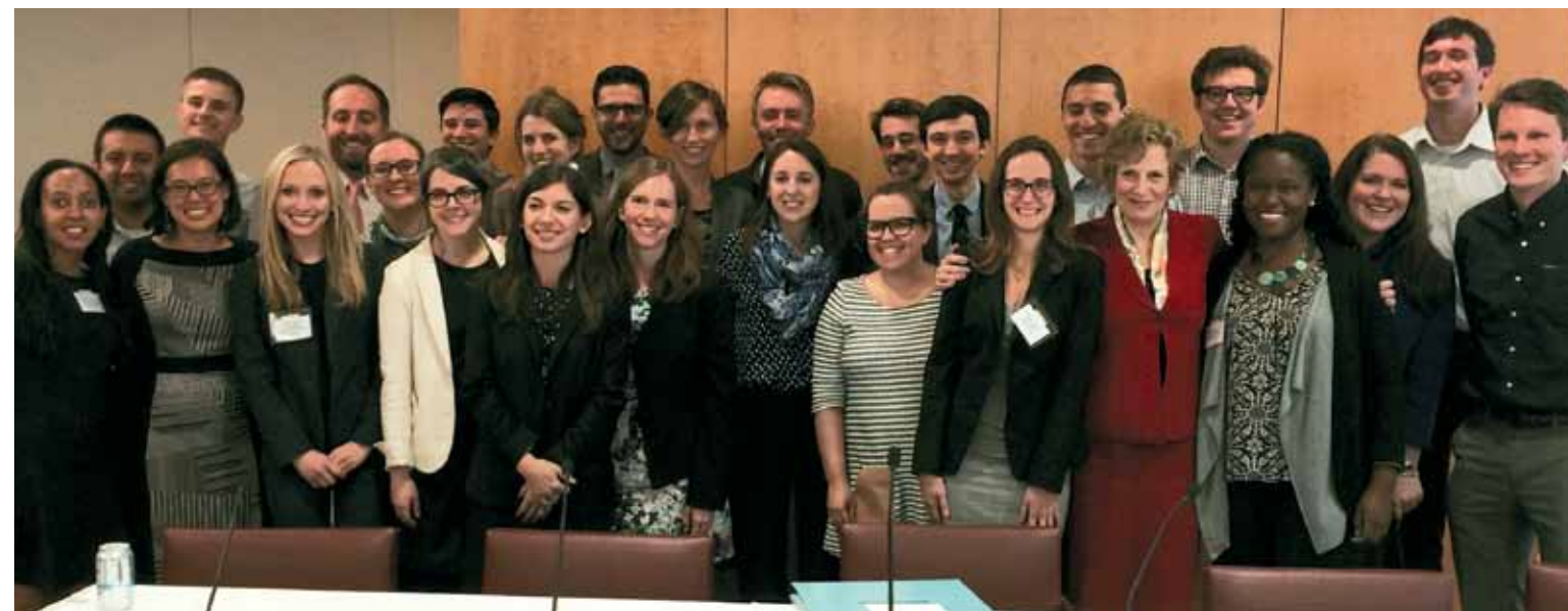
Skadden Fellows class of 2013