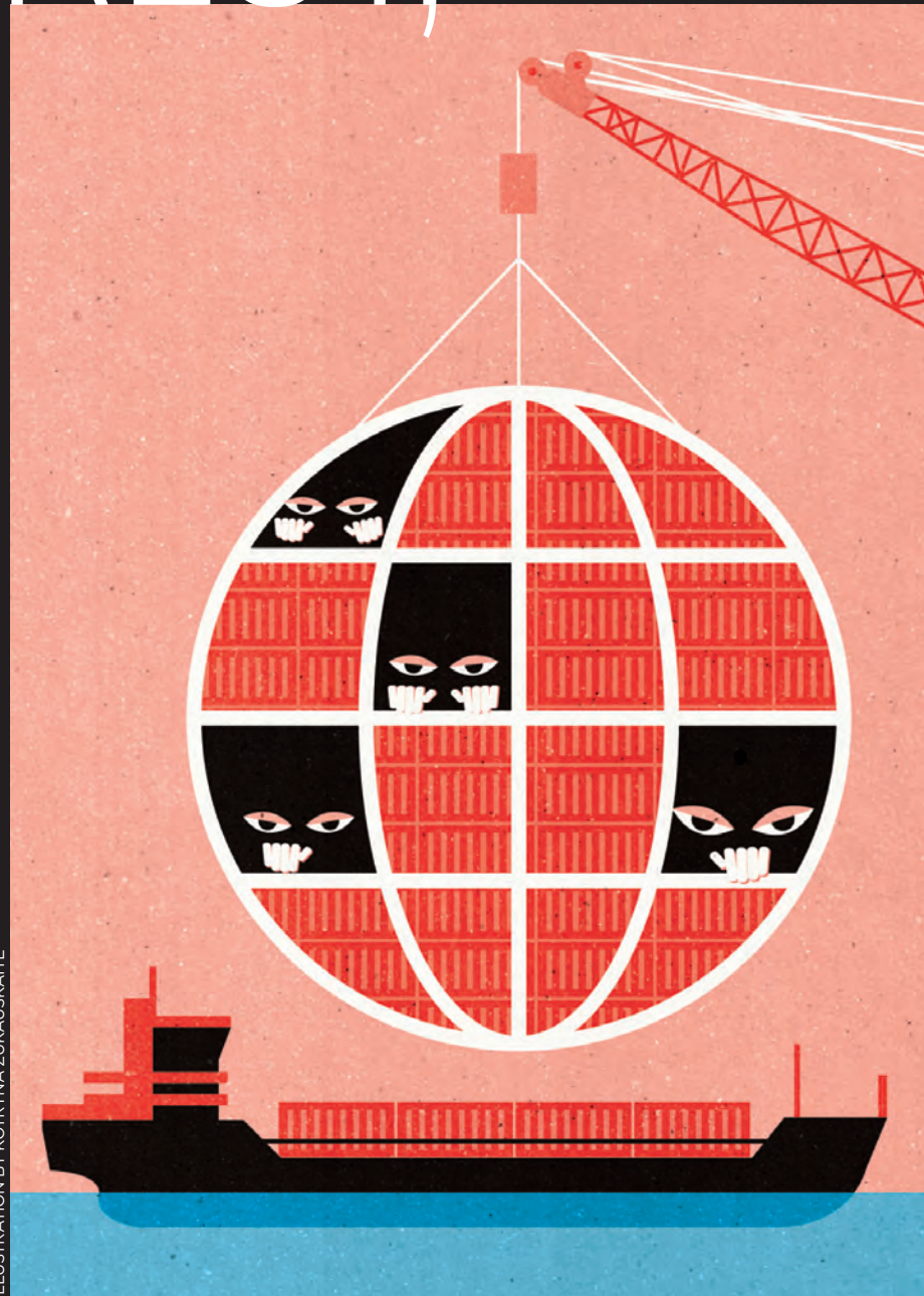
ILLUSTRATION BY KOTRYNA ZUKAUSKAITE